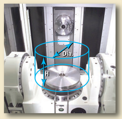
Max. Workpiece Dia. x H