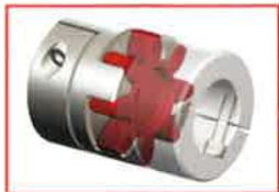
KTR Rotex Coupling