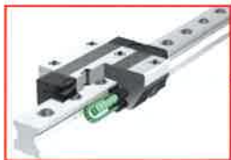
THK Cross Roller Linear Guide Ways