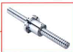
Super "S" Nut