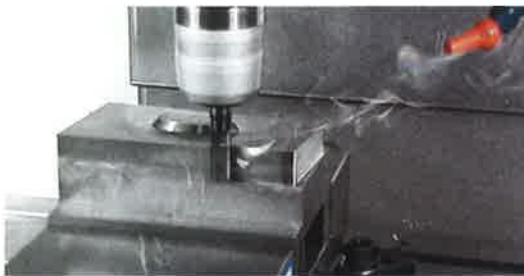
Standard 12,000rpm spindle delivers unparalleled cutting performance on a wide range of materials.

Powerful 35HP ■ 40 Taper ■ 30" x 20" VMC